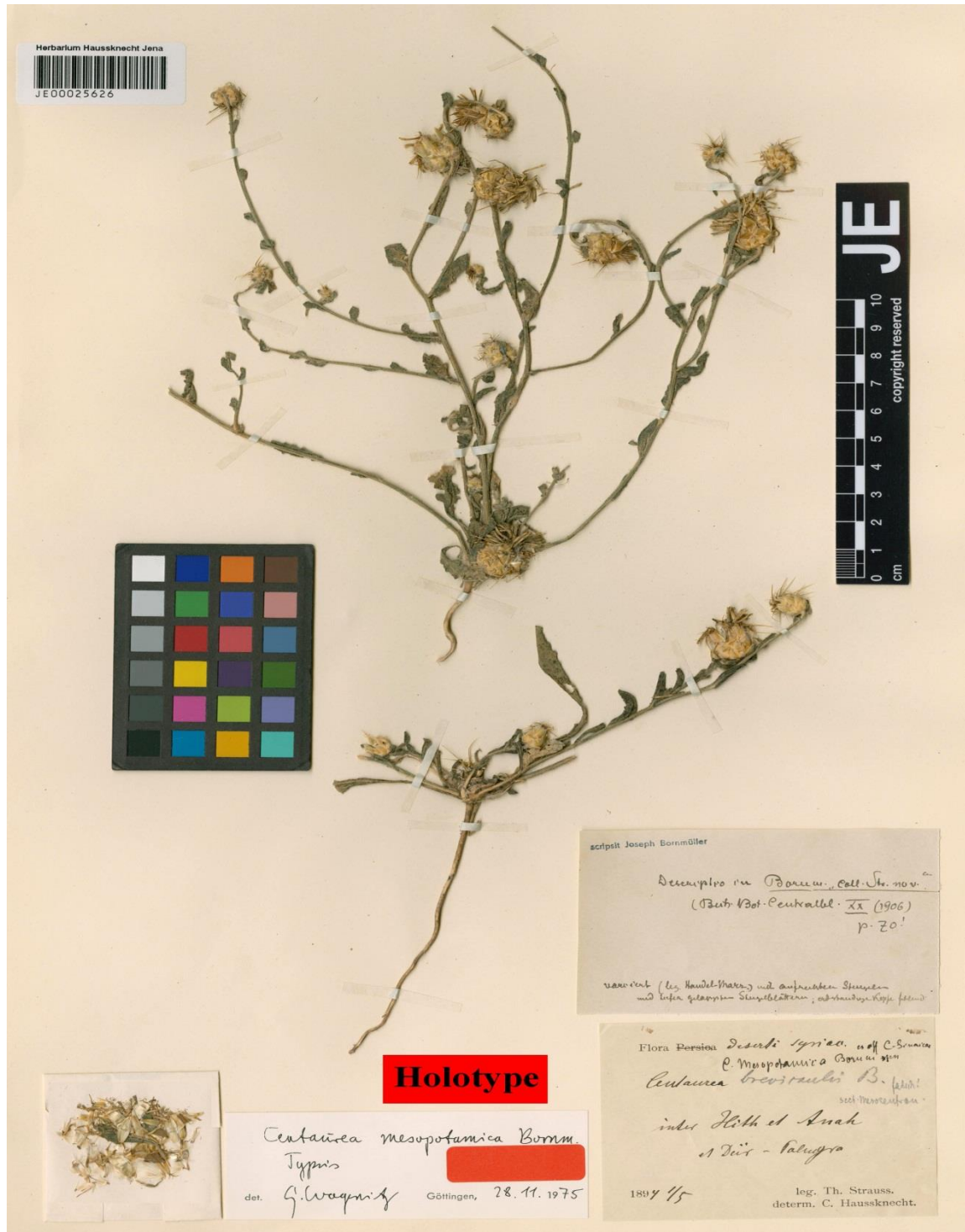
Figure 3. Holotype of Centaurea mesopotamica deposited at JE.