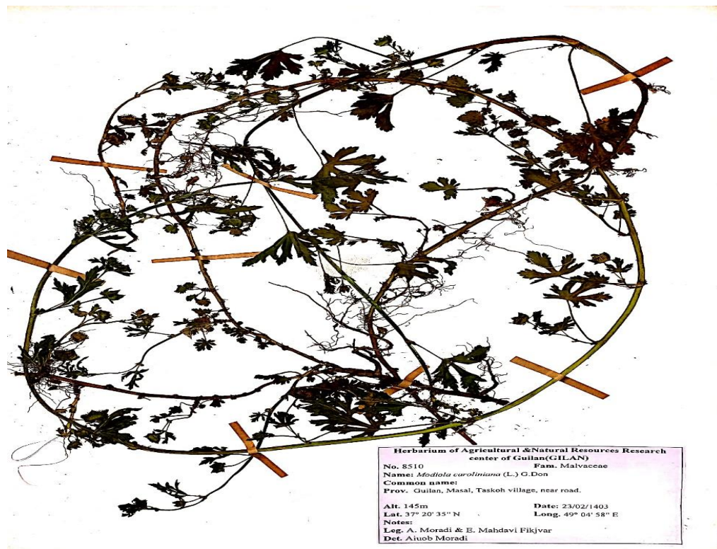
Figure 2. Herbarium specimen of Modiola caroliniana