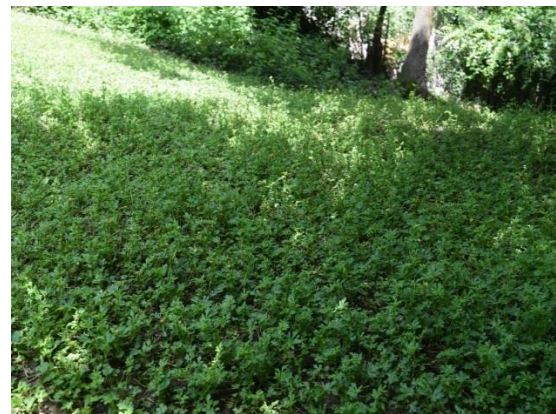
Figure 3. Modiola caroliniana close up (left) and a view of its dense growth in the new habitat (right)

Previously, another alien species of Malvaceae, named Sida rhombifolia L., was recorded from Nowshahr (Amini et al., 2003). Sida rhombifolia is considered a weed and invasive plant that is spreading in tea and fruit gardens, along roadsides, and forest edges. It also proliferates inside the open and degraded forests of Gilan and Mazandran, becoming a significant environmental and agro-horticultural problem in these areas.